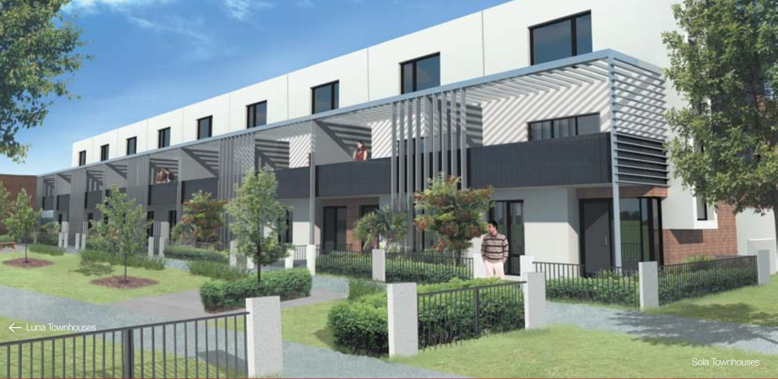
← Luna Townhouses